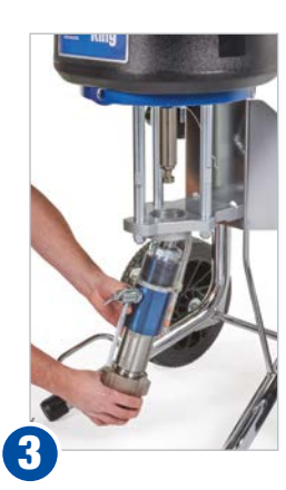
Spin pump to remove